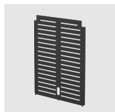
EVER1000 MM Installation panel 16-120-1

We reserve the right to introduce changes in the product specifications after the printing and publication of this document.